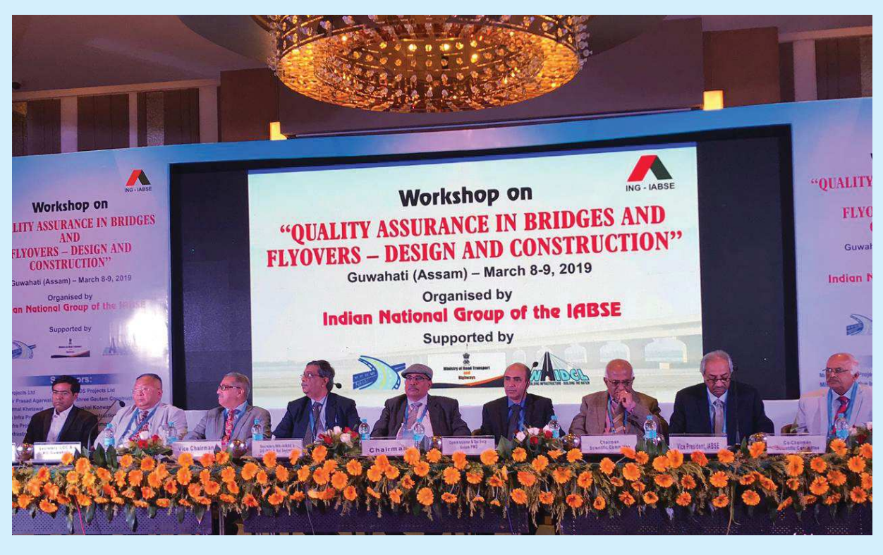
A view of the Dais during the Inaugural Function

During the two day Workshop, several eminent engineers in the field of bridge & structural engineering made presentations on the different aspects of quality assurance in design and construction of bridges and flyovers along with some interesting case studies for the benefit of the participants. Participation of delegates in floor intervention and discussions was very encouraging.