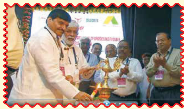
Shri Shivpal Singh Yadav, Hon'ble Minister, UP, PWD lighting the traditional Inaugural Lamp along with high dignitaries