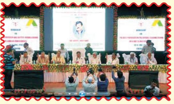
A view of the Dais during the Inaugural Function